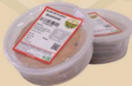
BAJARI METHI GARLIC BHAKHARI