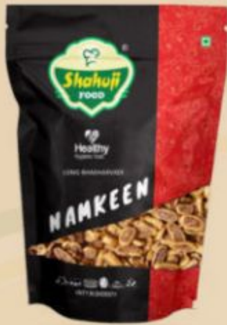
LONG BHA KHARVADI