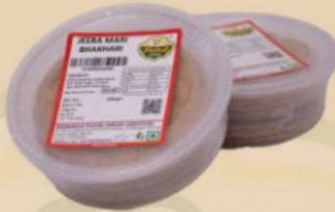
JEERA MARI BHAKHARI