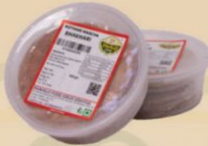
KOTHMIR MARCHA BHAKHARI