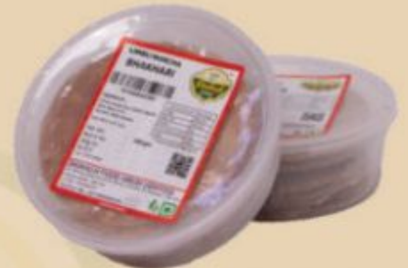
LIMBU MARCHA BHAKHARI