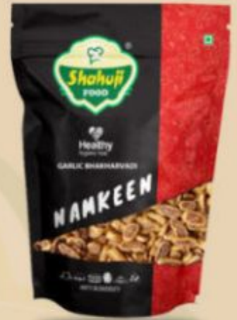
GARLIC BHA KHARVADI