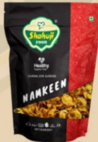
CHANA JOR GARAM