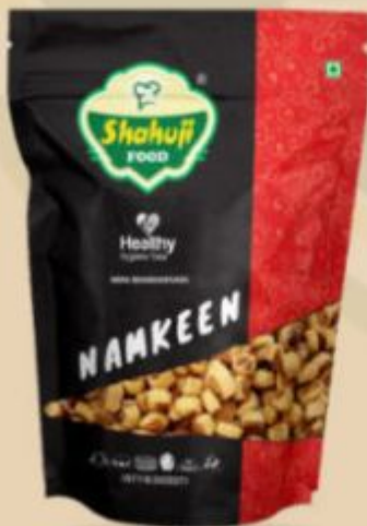
MINI BHA KHARVADI