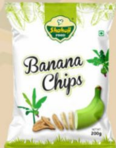
BANANA CHIPS (ROUND)