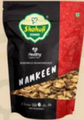
SANDWITCH BHA KHARVADI