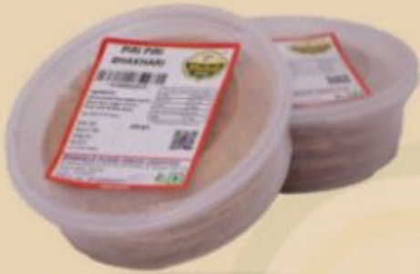
PERI PERI BHAKHARI