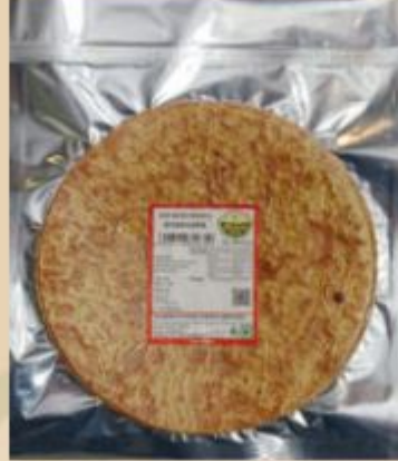
JAIN MAGGI MASALA