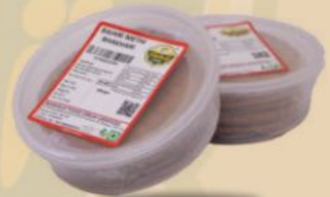
BAJARI METHI BHAKHARI